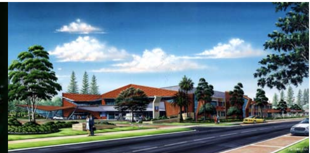
Geraldton Health Services Redevelopment