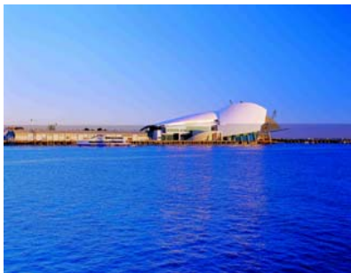
WA Maritime Museum – 2002 AIRAH Excellence Award for mechanical services design