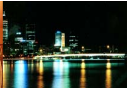
Narrows Bridge Lighting