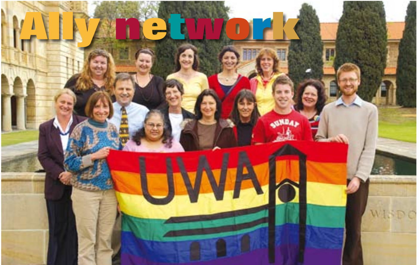
Students and staff involved in the Ally Network with the rainbow flag.

The groundbreaking Ally Network — the first to be developed in Australia and now taken up by seven other universities — is evaluating its progress to date. All Allies, both students and staff, are invited to be involved in evaluating and continuing to build the Ally Network at UWA.