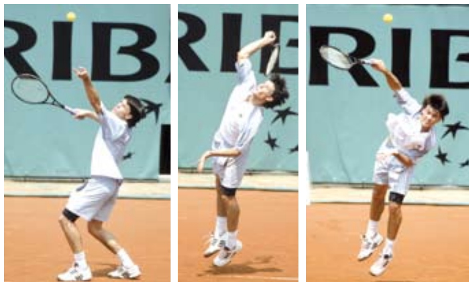
Tennis star Guillermo Coria serves – different styles can cause uneven loading on tennis players' shoulder joints.

"So surgeons are reimplanting hyaline (articular) cartilage and the biomechanist plays a role in working out how to stimulate the cartilage cells to encourage them to spread and grow."