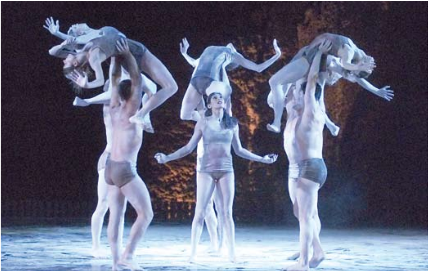
Dancers in Munaldjali lift their partners. Some male ballet dancers are suffering from lower back pain