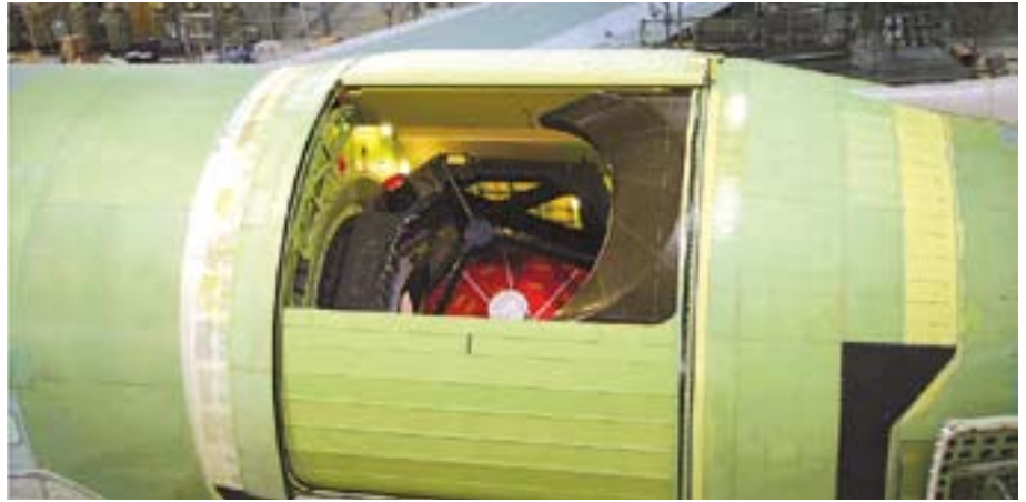
The telescope is mounted in a cavity at the rear of the 747.

"Then after about four months of testing, we will start flying with the door open and start our science commissioning of the observatory."