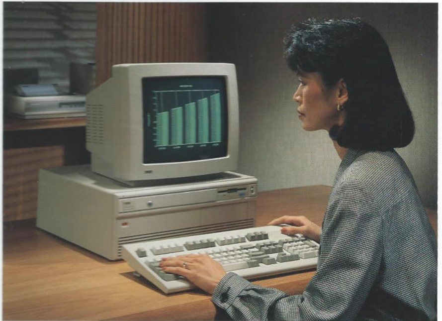
The DECstation family of powerful, industry-standard personal computers is an extension of Digital's PC integration products.

More than a PC LAN solution, PCSA offers PC users an enhanced work environment that encompasses the computing resources of the entire enterprise.